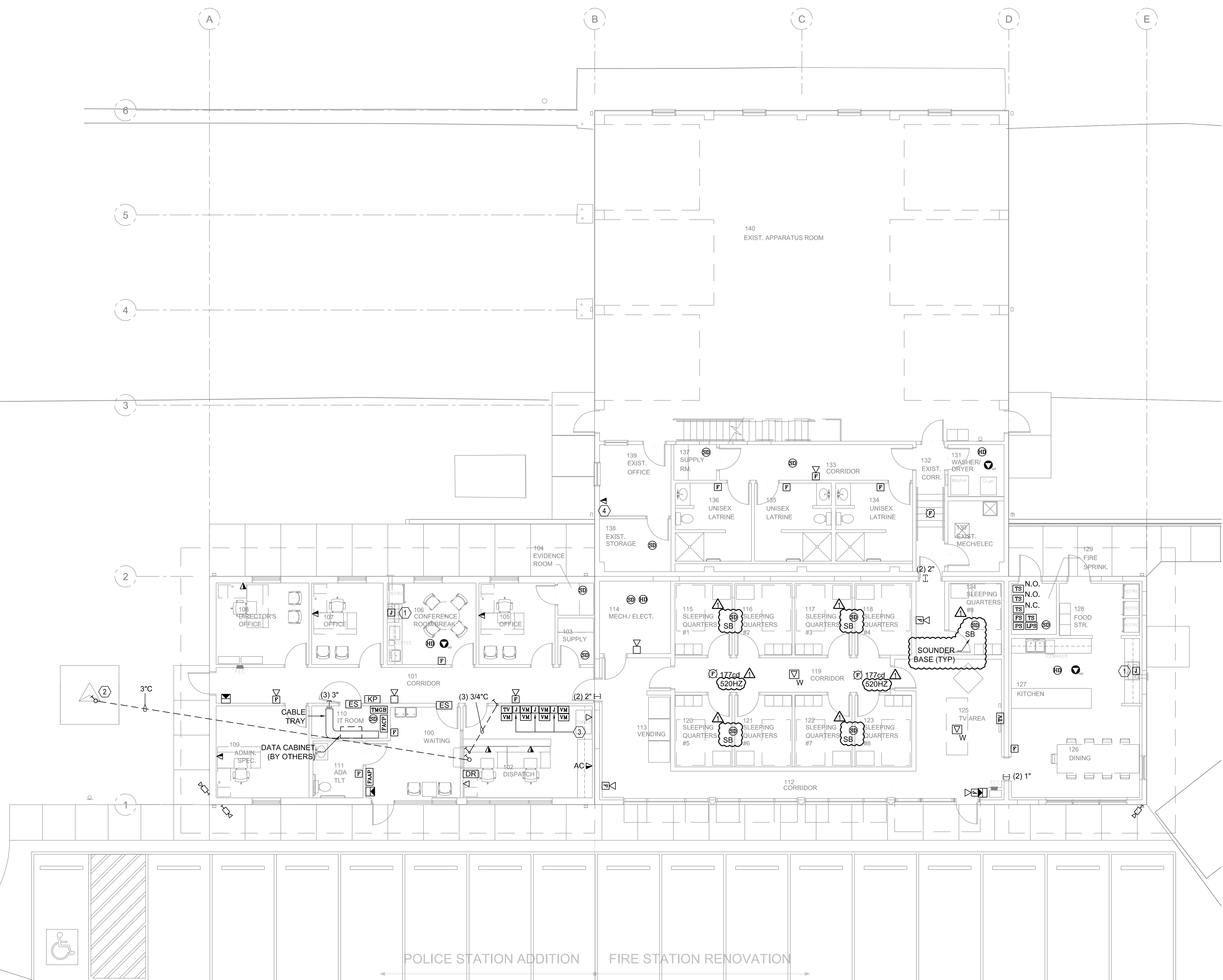
1 FLOOR PLAN - SYSTEMS 1/8" = 1'-0"